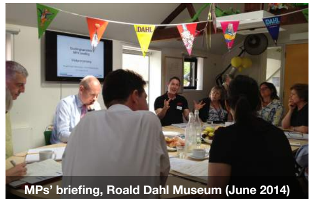
MPs' briefing, Roald Dahl Museum (June 2014)

Rt Hon Cheryl Gillan, MP for Chesham and Amersham