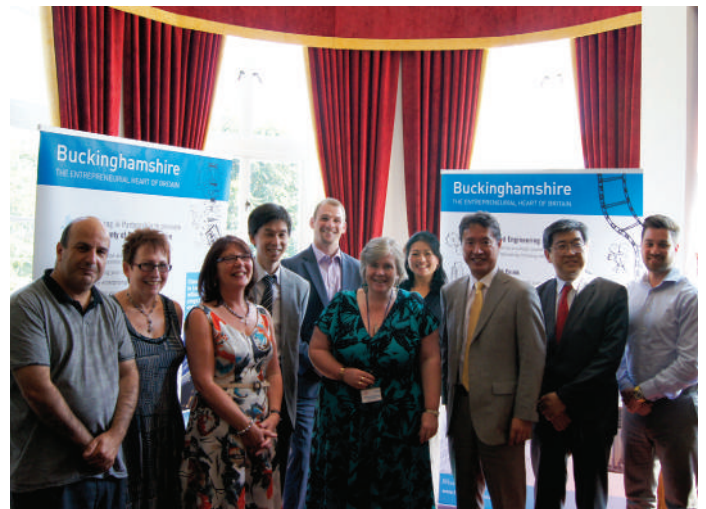
Kansai Chamber of Commerce (Japan) visit to Buckinghamshire

Were secured into Buckinghamshire during 2014/15 of which 12 are foreign owned companies.