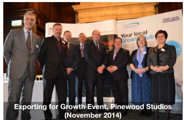
Exporting for Growth Event, Pinewood Studios (November 2014)

We work hard to ensure businesses in Buckinghamshire can make the most of government funded sources of support like the Business Growth Service and UK Trade and Investment and have hosted workshops on Exporting, Food and Drink and have supported organisations looking to reshore their operations.